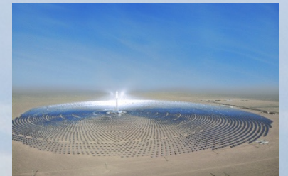
Dunhuang 100MW Tower CSP