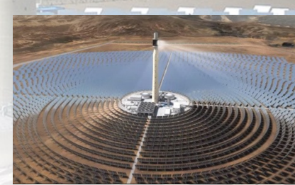
NooRo-III 150MW Tower CSP