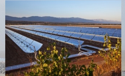
NooRo-II 200MW Parabolic Trough CSP