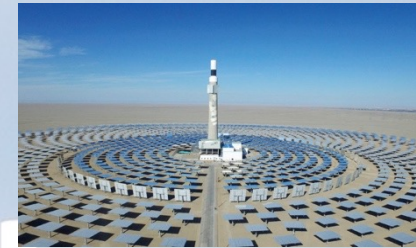
Dunhuang 10MW Tower CSP