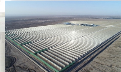
Delingha 50MW Parabolic Trough CSP